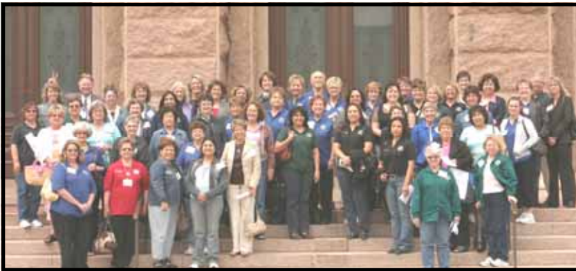
Treasurer's make a strong presence at the State Capitol. ↑